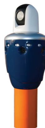
With PTZ Picard