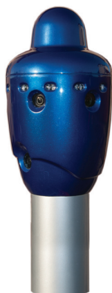
Without PTZ Prompt

Detecting and recognizing objects at great distances using an automatically controlled PTZ camera. Continuous 360-degree panoramic image analysis, intelligent video analysis using two built-in T9 supercomputers. Perfect for robotized surveillance patrolling and video surveillance on large-sized premises that are out in the open. Provides for a high level of reliability for detecting people through a detection system that functions autonomously at different distances. Supports edge recording when working with the ONVIF VMS.